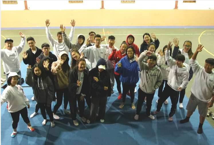
TEAM BUILDING CAMP